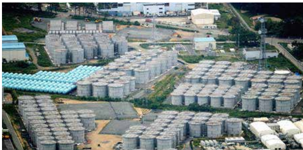
A portion of the "tank farm" at Fukushima Daiichi

The Fukushima catastrophe has resulted in the release of radioactive fallout into the atmosphere and the discharge of radioactive liquid effluent into the Pacific Ocean. Radionuclides released include cesium 134, cesium 137, strontium 90, plutonium 239, iodine 131 and tritium.